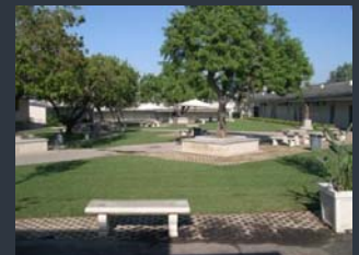
The quad is the latest renovation which was completed in the fall of 2009.

Not wanting to rest, Aquinas has undergone over $2.5 million in physical plant improvements. All of the improvements were accomplished through the generosity of the local business community and our alumni. Come and see how your campus has changed over the past five years.